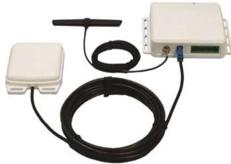
DUO 900 Hybrid GPRS/Satellite economic - anytime-anywhere