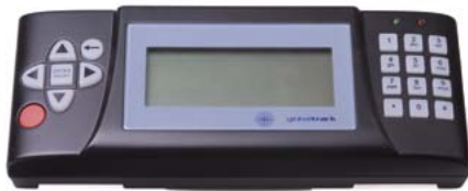
Message Data Terminal Economic, short two-way messaging via SAT-340 and DUO-900