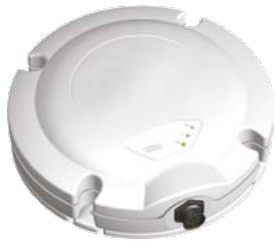
SAT-340 Aviation, marine and remote land application