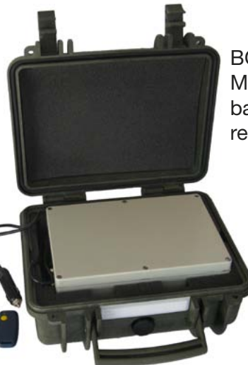
BOT-340 Mobile tracking with battery backup and remote panic buttons