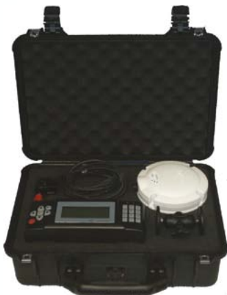
Rapid Deployment Kit Mobile on any asset with full two-way messaging capabilities