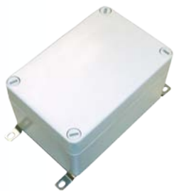
BAT-340 Trailer and train tracking. 36 months operational without recharge